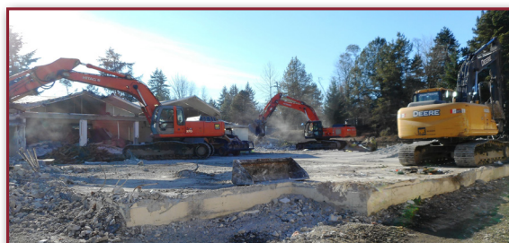
Demolition at the North Mercer campus

The three facilities projects approved by Mercer Island voters in the February 2014 bond proposition to address overcrowding are on time and on budget. The Mercer Island High School addition is scheduled to open for the 2015-16 school year, while the middle school expansion and new elementary school will be ready for the 2016-17 school year. Updates are available online at www.MercerIslandSchools.org/Construction .