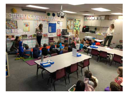
Students learn about habitats and natural resources.