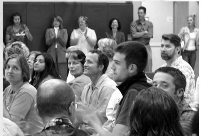
Staff members and community partners listen to the presentations at the MISD staff breakfast on August 30th

Phone-A-Thon, on October 16 and 17 this school year, and the Breakfast of Champions on March 27, 2007. Watch for more news of these events in this newsletter and on the district web site.