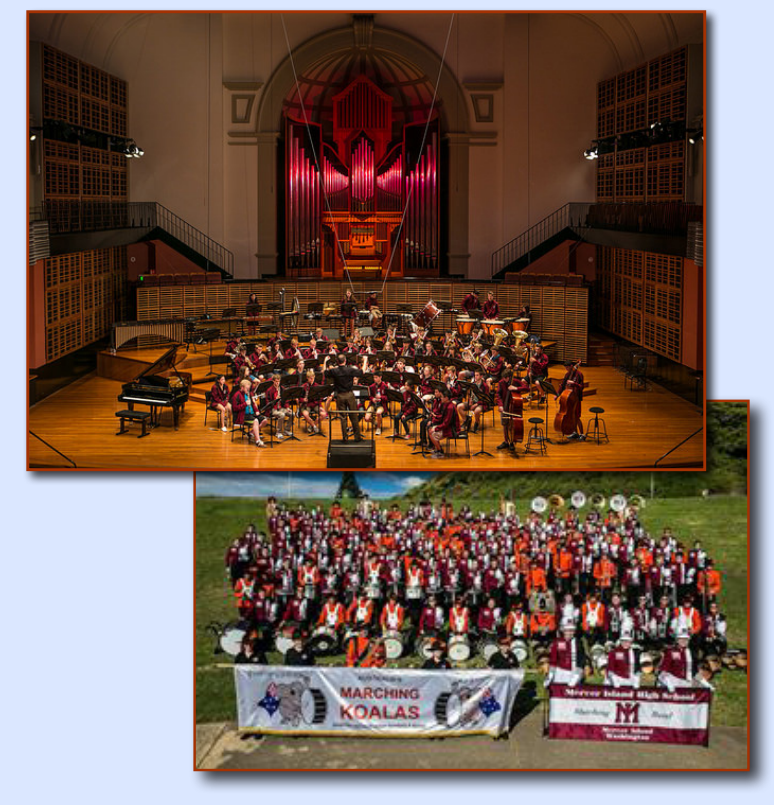
Top picture: MIHS band students play at the Sydney Conservatorium. Bottom picture: Students with the Marching Koalas, an Australian marching band formed in 1986 after a visit from a U.S. high school.

McLellan added, "It was a spectacular trip on every level for the students!"